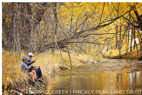
TENMILE CREEK | PRICKLY PEAR LAND TRUST

https://missoulacurrent.com/clean-drinking-water/