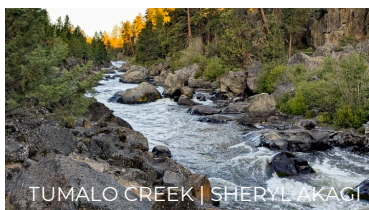
TUMALO CREEK | SHERYL AKAGI

In Bend, Oregon, more than 100,000 people rely on Tumalo Creek and its watershed, a major tributary of the upper Deschutes River that is protected by IRAs for clean drinking water.