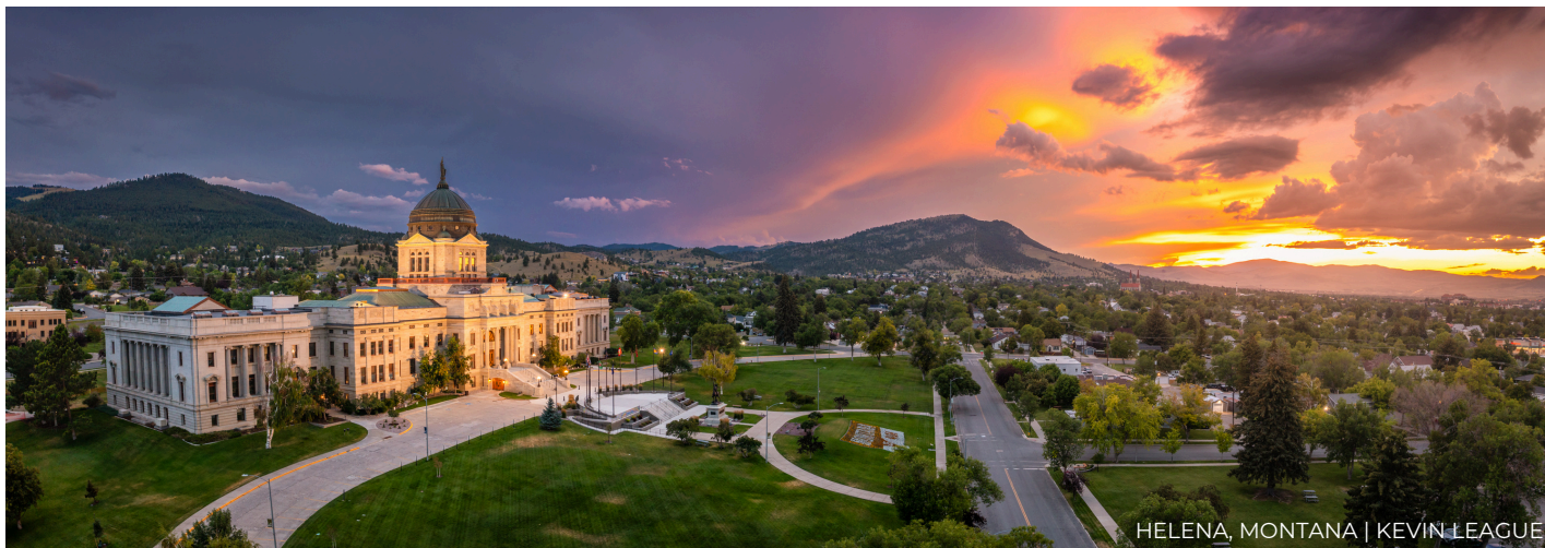
HELENA, MONTANA | KEVIN LEAGUE

In Bend, Oregon, more than 100,000 people rely on Tumalo Creek and its watershed, a major tributary of the upper Deschutes River that is protected by IRAs for clean drinking water.